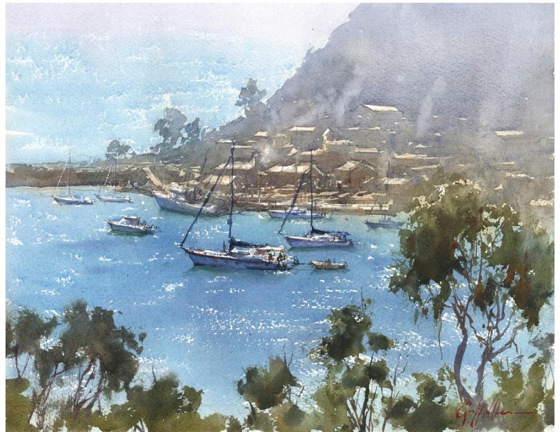
Dana Point Lookout 2